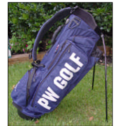
New Ping Golf Bags