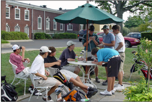
Colonial golfers relax after practice round at St. Martin's

PW runs their undefeated league streak to 20 matches with a 220-226 "come-from-behind" win at Methacton V2 Colonials open match play on Wednesday as they host Upper Dublin's JV team at Green Valley CC. Braunsberg opens play at Green Valley CC (Home Course) with a one-under-par practice round (10 holes).