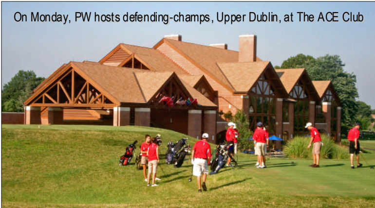
On Monday, PW hosts defending-champs, Upper Dublin, at The ACE Club