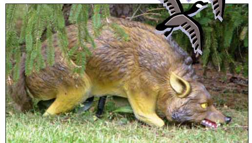
New addition to help keep geese off the Green Valley CC